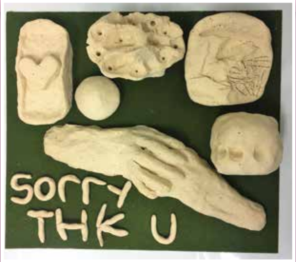
Clay expressions of emotions: Speaking the unspeakable

"Listening. Crying. Laughing. Eating Together."