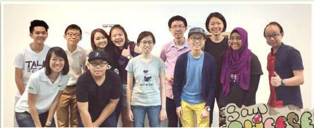
All smiles after presenting their photographs.

The workshop concluded with an exhibition of the participants' letters of reflections and the unsatisfactory photographs – the side that is usually not presented but present. As one of our participants shared, "Being bad at something is the first step, until I become good at it."